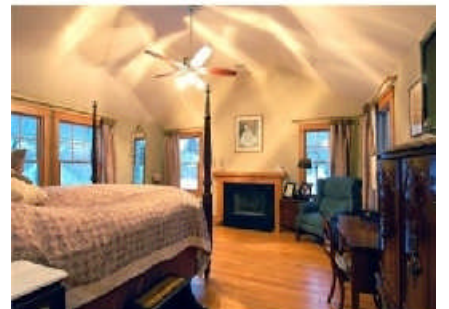
Master Bedroom with fireplace, walk in closet, attached master bath

The toilet is in a private room separated by a pocket door.