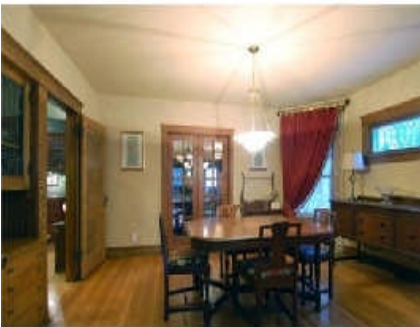
Dining room and living room are part of the original house

The kitchen being part of the family room makes this a true gathering place to enjoy friends!