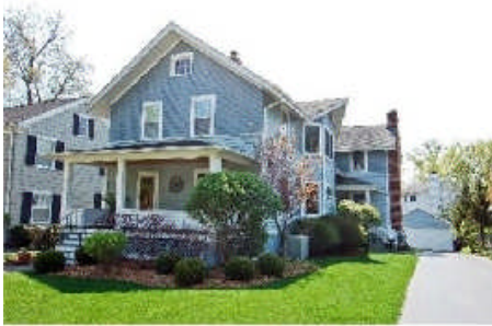
Historic Home completely re-modeled for today's family

The current owners of this home built in 1916 are only the second family to enjoy this residence which is in the Historic Hinsdale District.