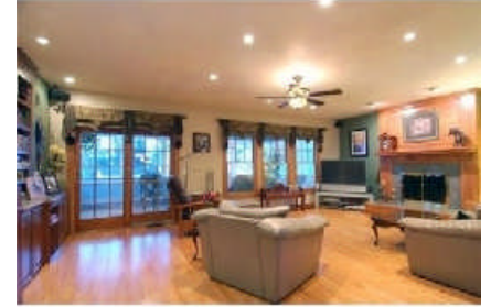
Large warm comfortable family room

The kitchen is adjoining to allow you to stay involved with the family conversation or your favorite show.