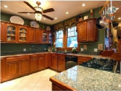
Large Kitchen is open to family room and breakfast room