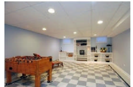
Basement family room for entertaining friend and family

The closet attached to the room is cedar lined for storing coats and clothing.