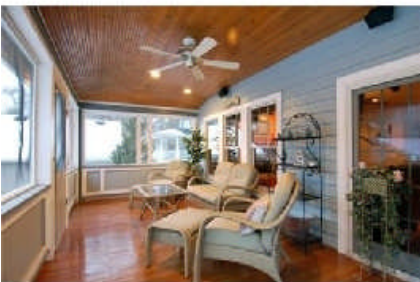
Outdoor living with peaceful view of the neighborhood

The double doors open the room into the kitchen and family room which is perfect for holidays and parties.